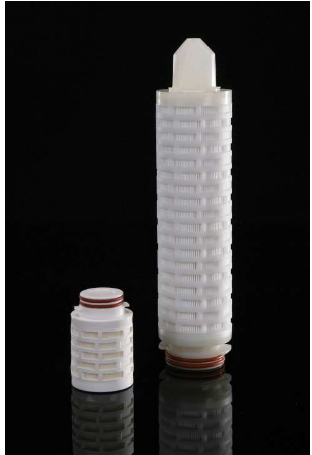
Note: PEPLYN is a registered trademark of Parker Hannifin Corporation.