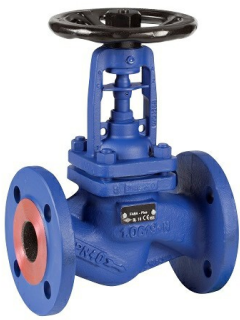
Fig. 436 Globe valve

Cast steel ARI-FABA bellow sealed globe valves, SS trim, pressure rating PN25/40, straight pattern, flanged ends acc. to DIN PN 25/40, outside screwed stem and non-rising handwheel.