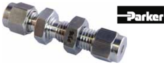
A-LOK Metric Bulkhead