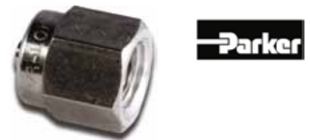
A-LOK Metric Tube Plug