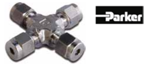
A-LOK Metric Union Cross