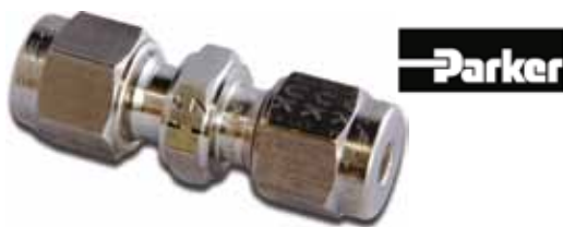
A-LOK Metric Union