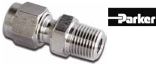
A-LOK Metric Male Connector - NPT