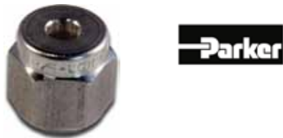
A-LOK Metric Tube Nut