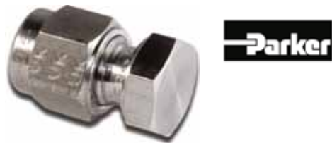
A-LOK Metric Tube Cap