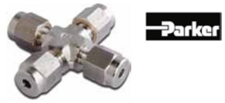
A-LOK Imperial Union Cross