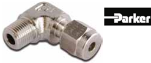
A-LOK Metric Elbow Connector - NPT