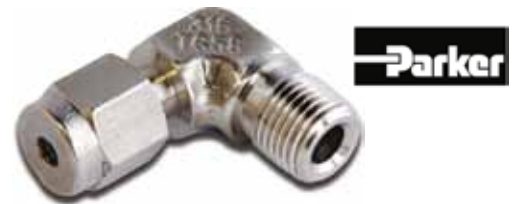
A-LOK Imperial Elbow Connector - NPT