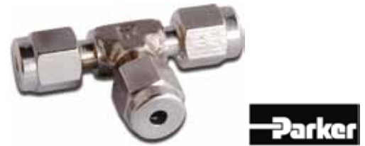
A-LOK Imperial Tee