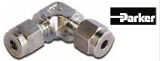
A-LOK Metric Elbow