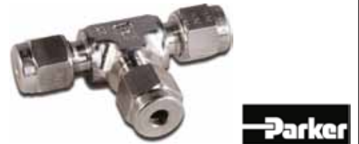
A-LOK Metric Tee