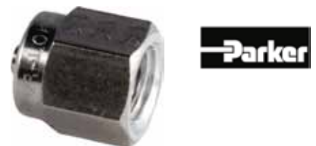
A-LOK Imperial Tube Plug