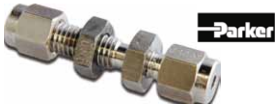
A-LOK Imperial Bulkhead