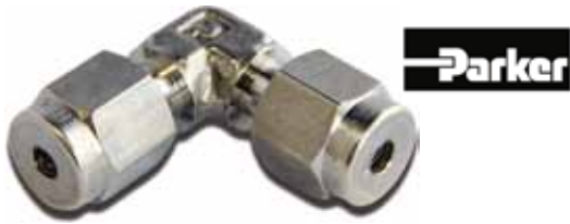
A-LOK Imperial Equal Elbow