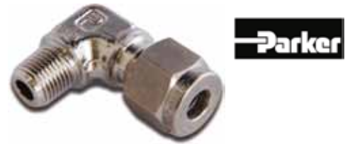
A-LOK Imperial Elbow Connector - BSPT