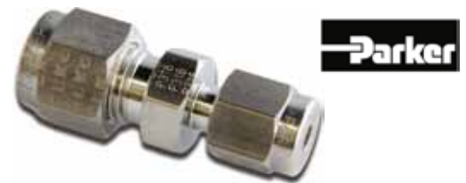
A-LOK Imperial Reducing Union