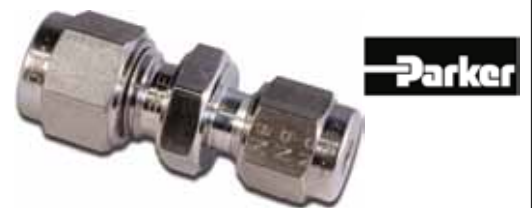
A-LOK Metric Reducing Union