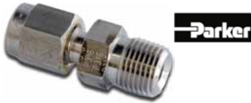
A-LOK Imperial Male Connector - NPT