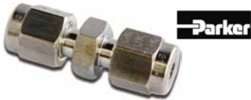
A-LOK Imperial Union