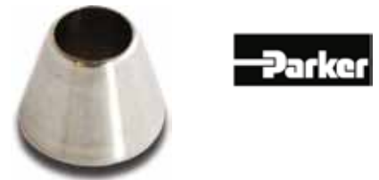
A-LOK Imperial Front Ferrule