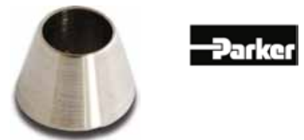
A-LOK Metric Front Ferrule