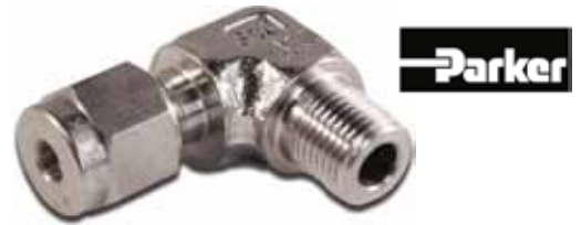
A-LOK Metric Elbow Connector - BSPT