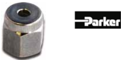
A-LOK Imperial Tube Nut