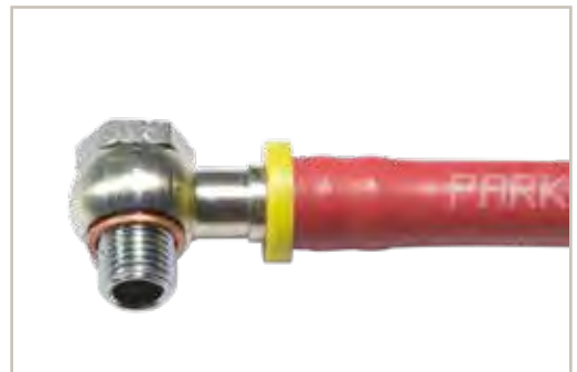
Complete banjo fitting