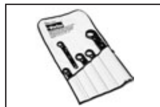
Triple-Lok® & Ferulok wrench kit

360° Snap-action ratchet wrench for hex sizes from 10 mm to 41 mm and inch sizes from 3/8" to 2 1/4" across flats. Inch sizes meet US government specifications and are listed as NSN-5120-00-474-7227.